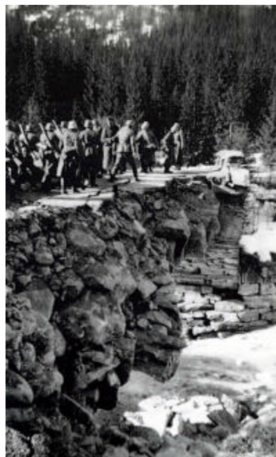
German soldiers crossing Lunde Bridge

The next battle took place at Tonsåsen near the Sanatorium between the 24 th and 27 th of April. The battle that took place on the 25 th is characterized as the hardest fought battles in the Valdres area. Two Norwegians were killed and several others were wounded. A Norwegian ski-patrol tried to attack the Germans from the back, but failed. During the battle the Germans requested air support from their planes. The falling bombs forced the Norwegians to retreat towards Aurdal. After the battle, the Germans burned the Tonsåsen Sanatorium to the ground.