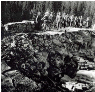
German soldiers crossing Lunde Bridge

The Norwegian army was already in place when the Germans marched into Bruflat and they fired on the Germans as they advanced into town. As the shots rang out, the townspeople panicked and fled to the hills seeking refuge at Klatstølen and Byfuglibygda. The Germans entered town a little later, and while a small unit of German soldiers passed by the church, a group of Norwegian soldiers, who had taken position on a stone range called Bruflatberget, by the Etna river, opened up on them.