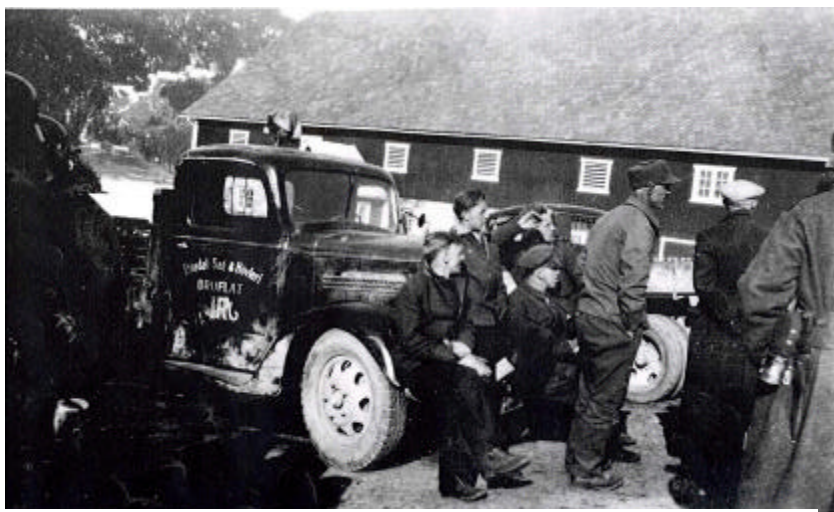
German soldiers "visiting" Bruflat.

Just after the skirmish at the Bruflat Church, two elderly looking women were seen walking from Lybekk's store towards the Bruflat farm. Shortly afterwards smoke and then flames were seen coming from the barn. No one knows for sure, but the theory is that the two elderly ladies were in reality two German soldiers dressed like women, who must have felt that the Norwegians would not shoot at them. Their plan was to provide a cover of smoke over the area so that it would be hard to recognize them when they attacked the Norwegian positions. The German